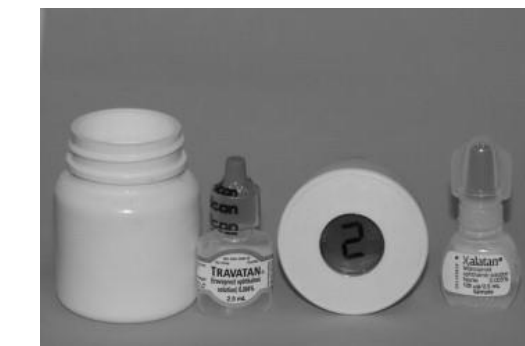
Figure 5. MEMS Cap