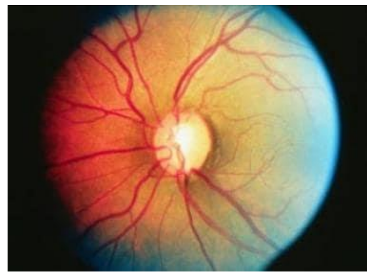
Figure 1. A photograph of the optic nerve head