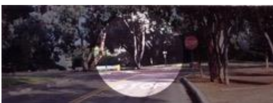
Figure 2. Depiction of characteristic structural and functional losses associated with glaucoma